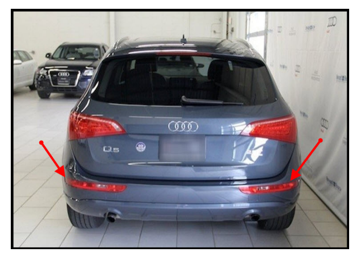
Figure 1. Rear side marker lights.