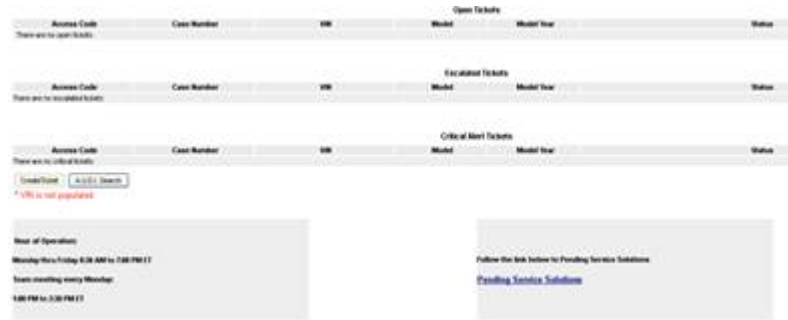
Figure 4. Technical Assistance page