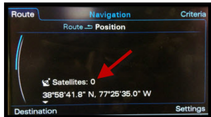
Figure 2. Number of satellites received.

To view the number of satellites being received, go to Nav >> Route >> Current Position (first item in list) >> Scroll up (Figure 2). If the system does not receive any satellites during this timeframe, submit a Technical Assistance Center ticket.