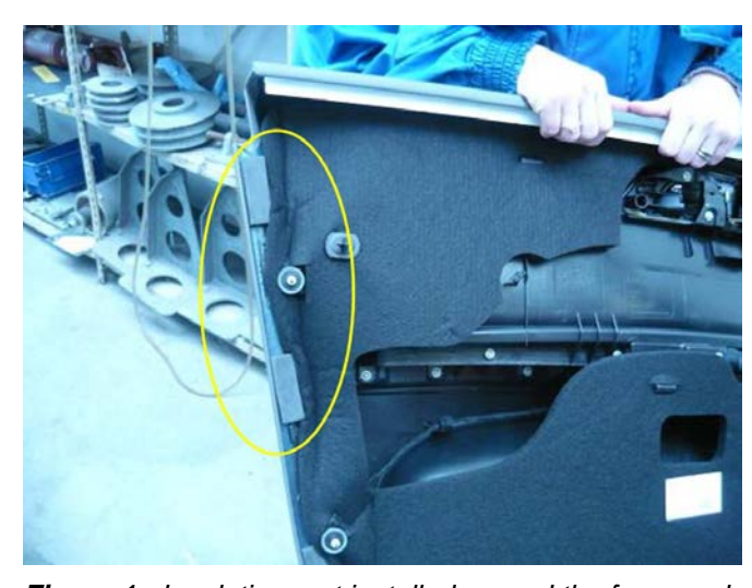
Figure 1. Insulation mat installed around the foam pads.

1. Remove the right and left door panels. Inspect the insulation mat. The insulation mat will likely be mounted around the foam pads (Figure 1).