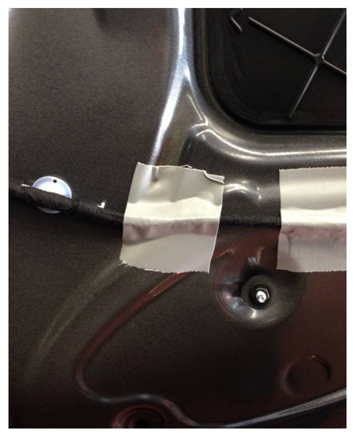
Figure 3. Tape applied to door wiring harness.

Check the wiring harness of the door. Any loose sections of harness or connectors should be secured with tape to eliminate the possibility of harness or connector movement against the door panel or door structure.