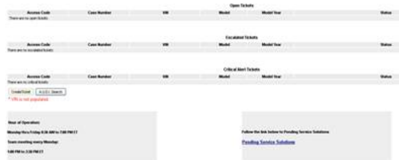
Figure 2. Technical Assistance page