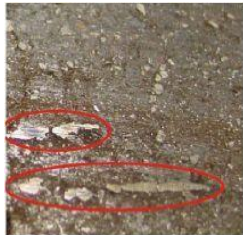
Figure 1. Metallic deposits.