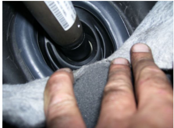
Figure 1. Sealing sleeve on the bulkhead.