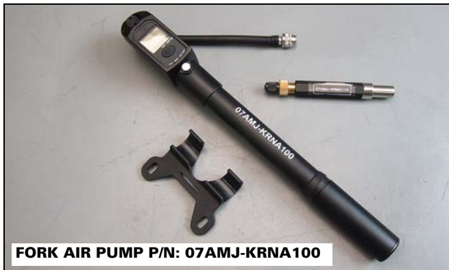
FORK AIR PUMP P/N: 07AMJ-KRNA100

Due to the higher operating air pressures (up to 189 psi) within the CRF250R fork, a new, two-stage, air pump is required.