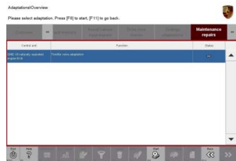
Throttle valve adaptation