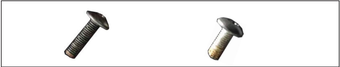
Figure 3 - Screws Without Thread Sealer