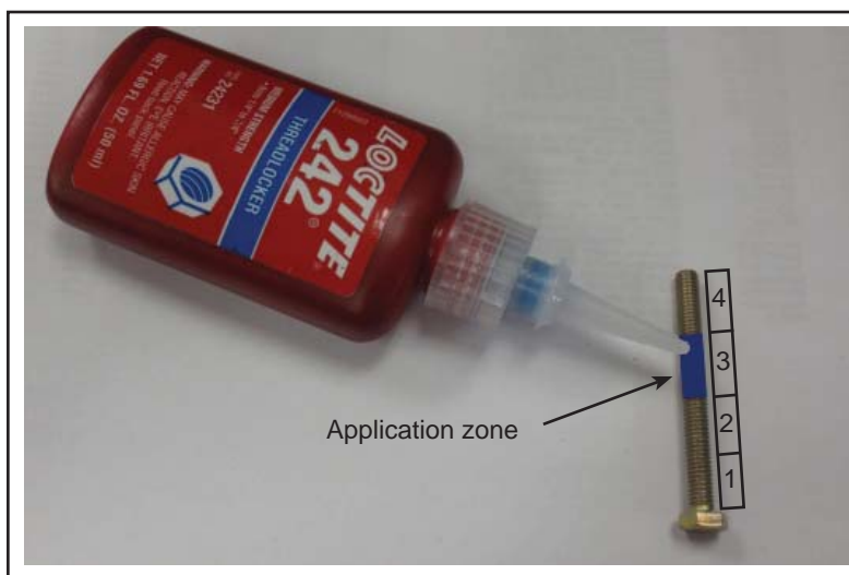
Figure 3 - Applying the Thread locker