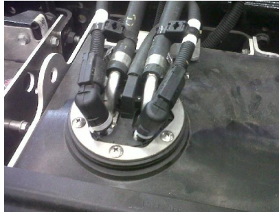
Figure 60. Diesel Exhaust Fluid (DEF) Tank Pickup Assembly