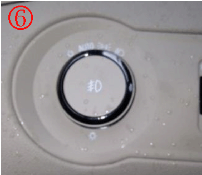
No Fog Lamp switch RPO T4A (HEADLAMPS-HALOGEN)