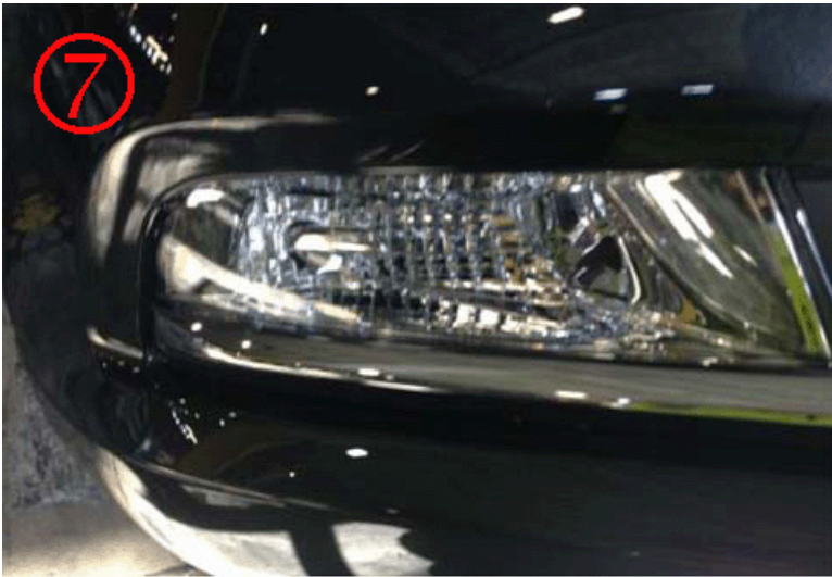
Fog Lamp (uplevel)