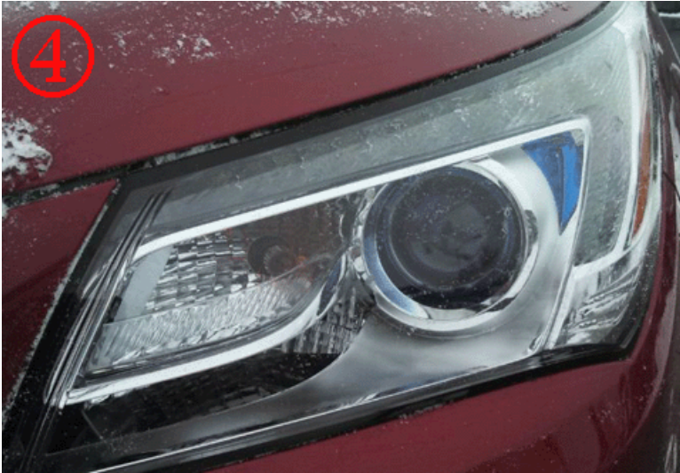
Daytime Running Light (base)