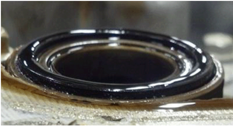
This is an example of a new seal