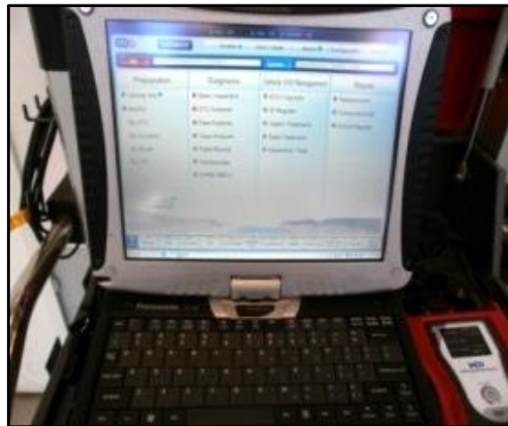
Global Diagnostic System (GDS)

This bulletin provides information related to an ECM software upgrade for all 2012-2013MY Rio (UB) 1.6L vehicles which may exhibit a knocking or pinging concern under moderate or heavy acceleration, especially while driving on an inclined road. To correct this condition, the ECM should be reprogrammed using the GDS download as described in this bulletin. Before performing this procedure, verify the VIN falls within the production ranges by consulting the table on page 7. For confirmation that the latest reflash has been done to a vehicle you are working on, verify ROM ID using the tables in this TSB.