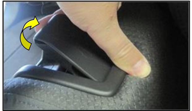
Verify excessive effort required to operate handle.

You may need to apply pressure to the seatback in order to free a jammed recliner mechanism.