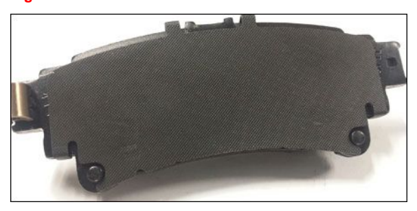
Figure 3. NEW 1-Piece Rear Brake Shim