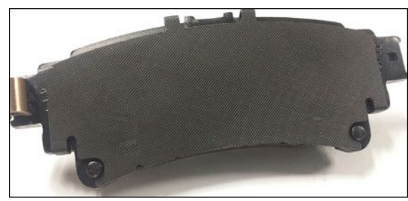
Figure 1. NEW 1-Piece Rear Brake Shim