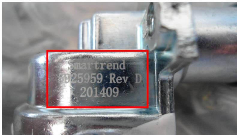
Figure 2: Smartrend Foot Switch Stamp