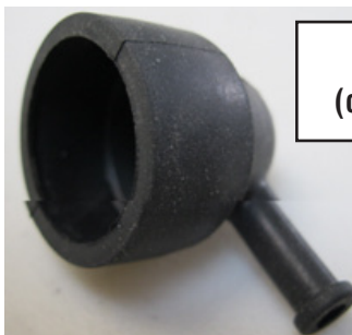
Original (old style) cap