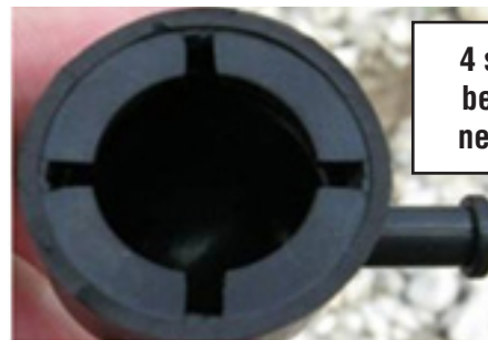
4 seal breaks have been added on the new cap as shown.