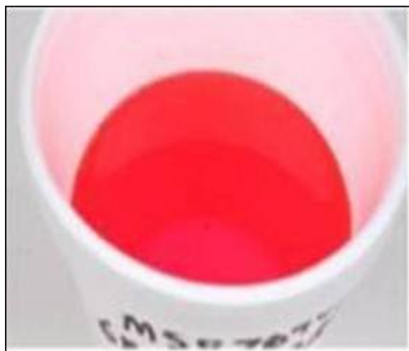
VW- GUS012001G1 / G 0120011G Pink HOAT Model Years 2000 to 2012