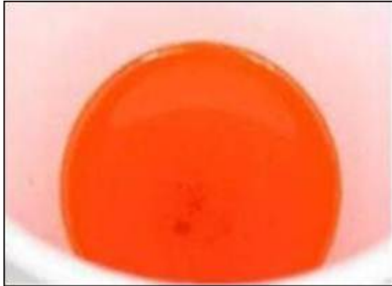
Fig. 3 Orange HOAT Coolant

Factory Fill HOAT Model Years 2000 to 2012