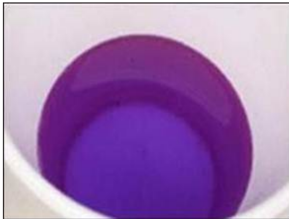
VW- G 0120021G Purple OAT Model Years 2013 Forward

Part number GUS012A0101 / GUS012A011O Hybrid Organic Anti Corrosive additive is for HOAT coolants only, and IS NOT compatible with OAT.