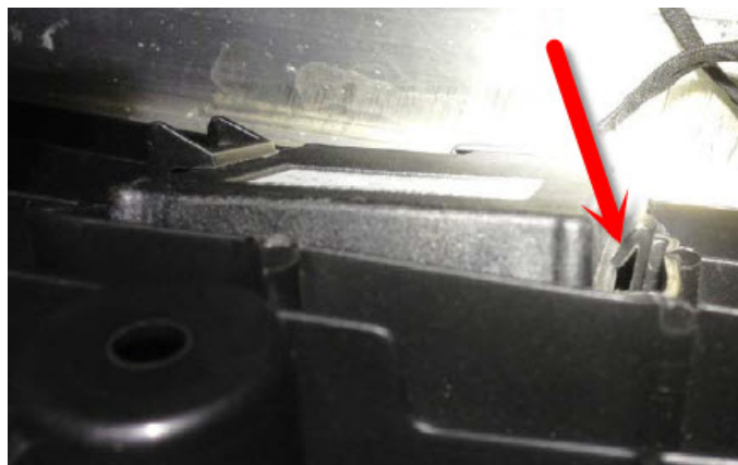
Figure 1. Homelink control module tab not secure.

The locking tab for the Homelink control module does not securely hold the module in place (Figure 1), which causes it to come loose and bang against various support structures at the front of the vehicle (Figure 2).