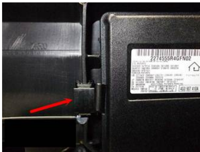
Figure 4. Modified clip installed behind locking tab.