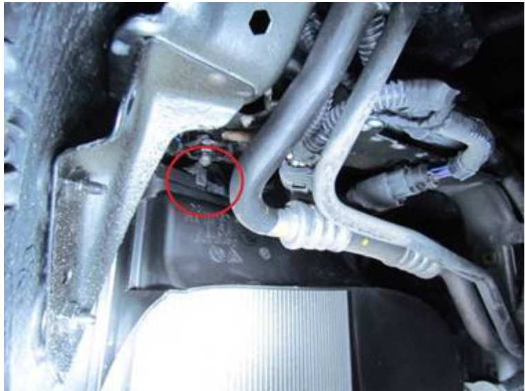
Figure 10. View of exit air duct affixed to mounting hook.