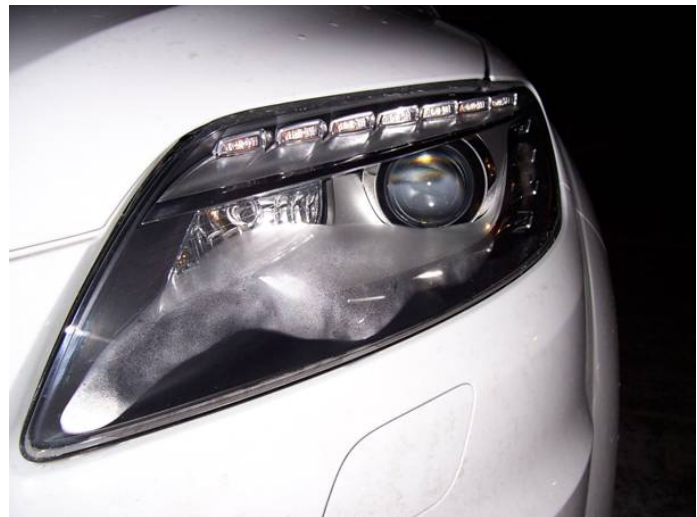
Figure 1. Moisture in headlamp.