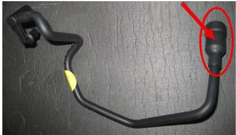
Figure 2. Updated ventilation hose with integrated filter.

Tip: The updated ventilation hose can be recognized by the integrated filter (Figure 2, arrow).