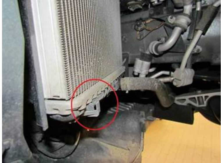
Figure 7. Lower exit air duct attachment point to charge air cooler.