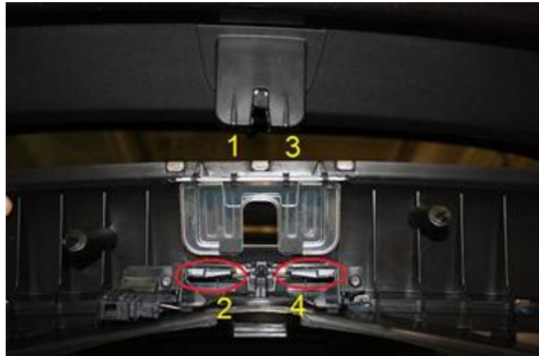
Figure 1. Inside vehicle view of rear lid latch showing location of G526 (2) and G525 (4) on rear sill trim, and contact points (1 and 3).

When the rear lid is opened, the paddle switches change state and the comfort system central control module 2, J773, will read G525 and G526. It will then communicate to the comfort system central control module, J393.