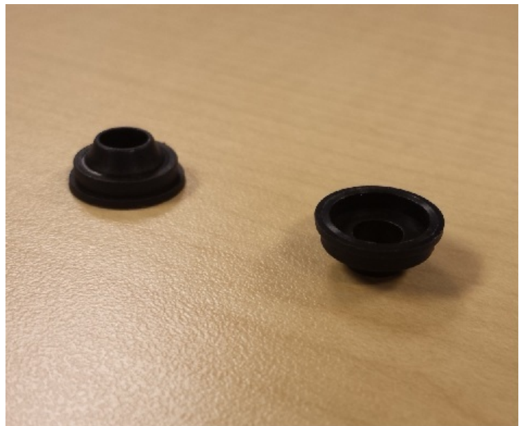
Figure 3. Spacers for underneath paddle switch assembly.

Tip: If factory service parts are not available, improvise by using spacers with dimensions of no less than 5.5mm I.D., no greater than 13mm O.D., and no thicker than 5.6mm.