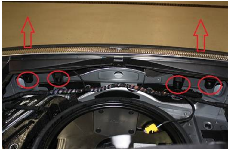
Figure 2. Rear cargo area trim plate removal. The T25 Torx® screws to be removed are circled in red.