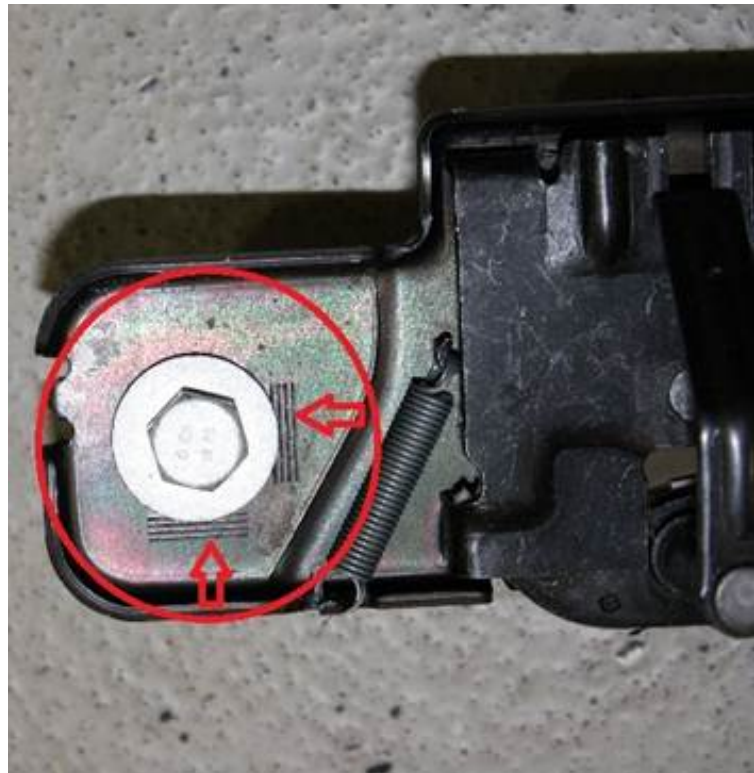
Figure 5. Power lid's motorized striker plate adjustability and serrated indicators.