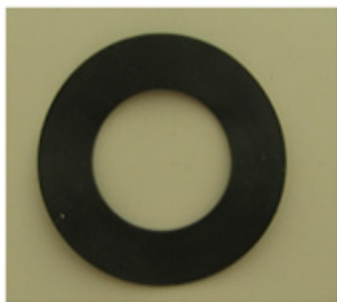
NEW p.n. 64168CA200, Spring Wave Washer