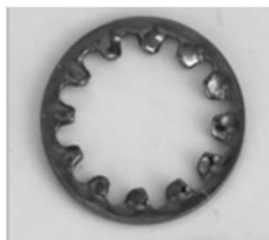
OLD toothed washer