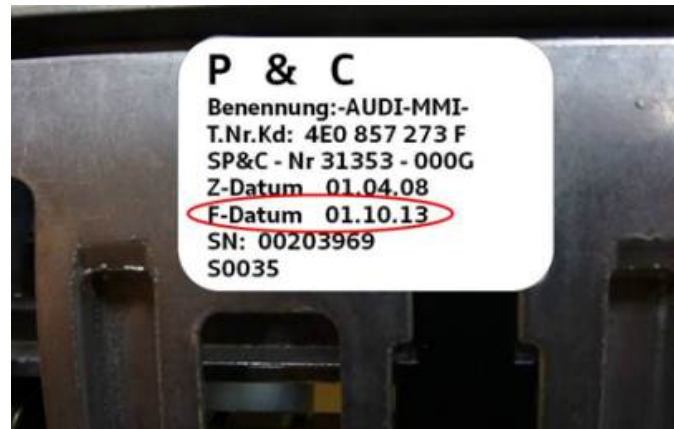
Figure 2. Location of the production date.