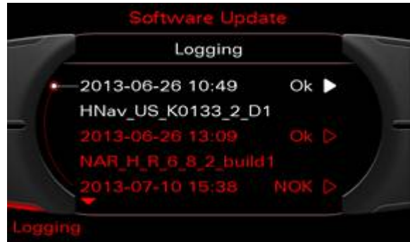
Figure 4. Software update log showing a successful software installation.

After a successful update, the screen will show the date on which the update was performed and the software that was installed (HNav_US_K0133_X_XX — The X characters will be one of several different numbers or letters). 'Ok' will be listed on the right. If K0133 does not have any rows with 'Ok', the update must be retried until it is successful.