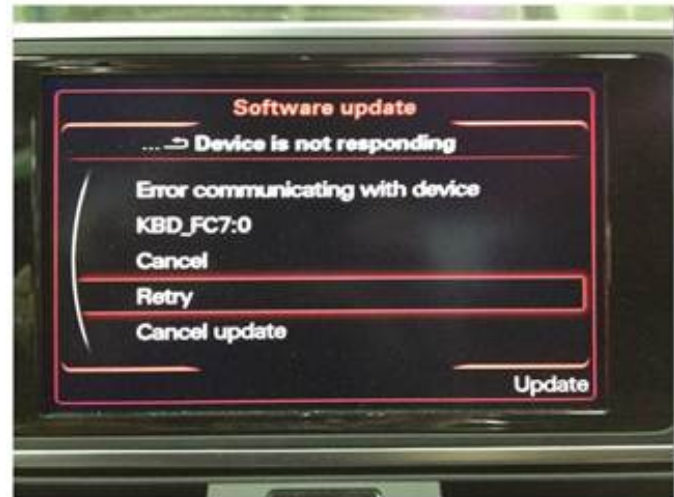
Figure 3. A device requiring a 'Cancel' selection.

Some earlier model year 2012 vehicles or vehicles equipped with Bose sound systems may experience certain modules that will not update properly during Step 16 of TSB 2028141. If this should occur, either choose 'Cancel' (Figure 3), or 'Skip device' (Figure 4), depending on the type of error. Do not choose 'Cancel update', as this may cause the software update to fail entirely. After the update is finished and the summary page is shown, select 'Retry' at the bottom of the list if it is available to attempt to update the modules again. If 'Retry' is greyed out, then the software update was successful, so select 'Continue' to proceed. In some cases 'Retry' may have to be repeated two or three times to get all modules to update successfully.