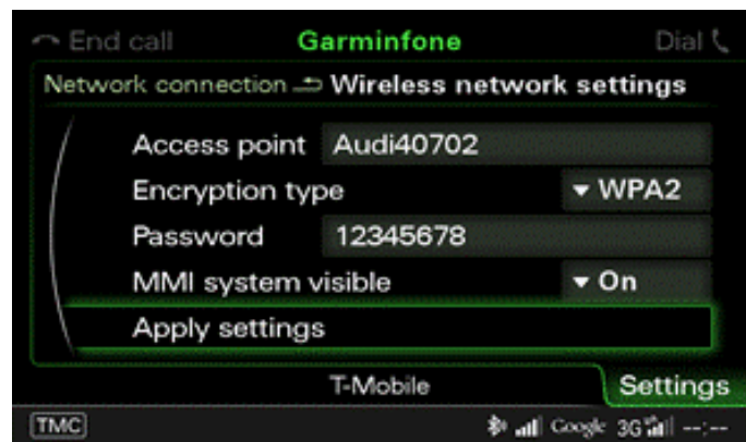
Figure 2. Wireless network settings.