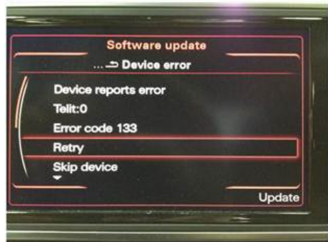
Figure 4. A device requiring a 'Skip device' selection.