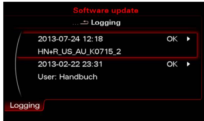
Figure 5. Software update log showing a successful software installation.