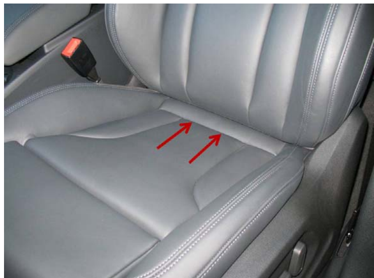
Figure 1. Arrows show area where additional fastening clips were added.

As a consequence of this change, the temperature sensor within the seat was moved to a location that is more sensitive to heat. As a result, the control limit is reached too early and the heat is reduced before the seating surface reaches the correct temperature.