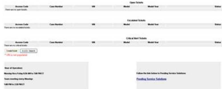
Figure 2. Technical Assistance page