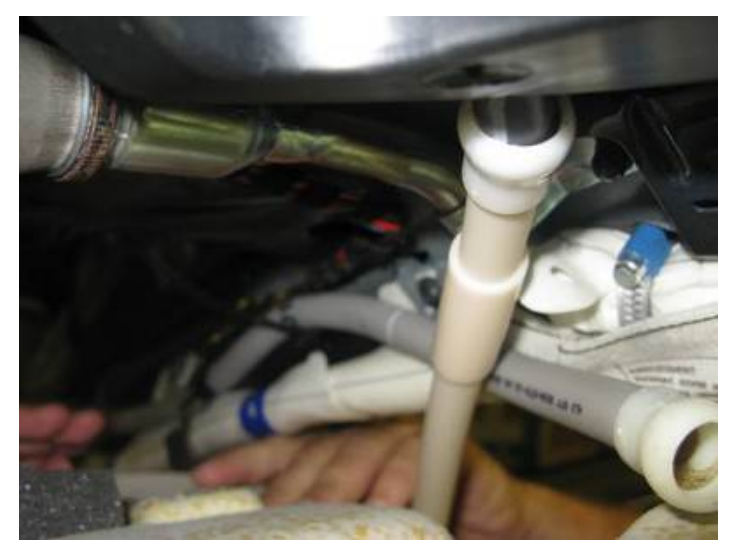
Figure 1. Disconnect original drain.

Attach the repair section in its place (Figure 1).