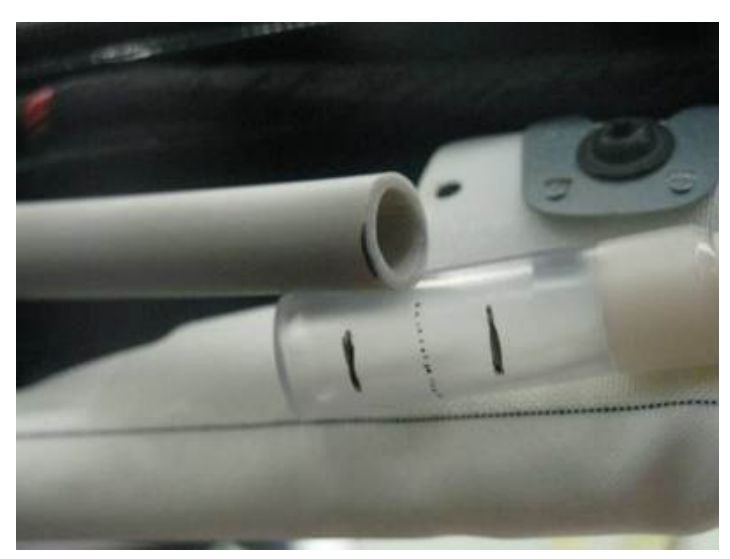
Figure 10. Cut hose.

Test that there is no leak or obstruction in any part of the lower section of the original hose by inserting a funnel with a small nozzle (~12mm – 13mm in diameter) into the open section of the lower hose enough so as to create a watertight seal, but not to excessively distort the hose. Slowly pour 200ml – 300ml of water into the funnel (Figure 11).