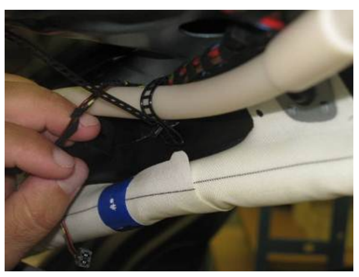
Figure 5. Routing the repair section though the cable ties.

3. Route the repair section through the cable ties and reattach (Figures 5 and 6).