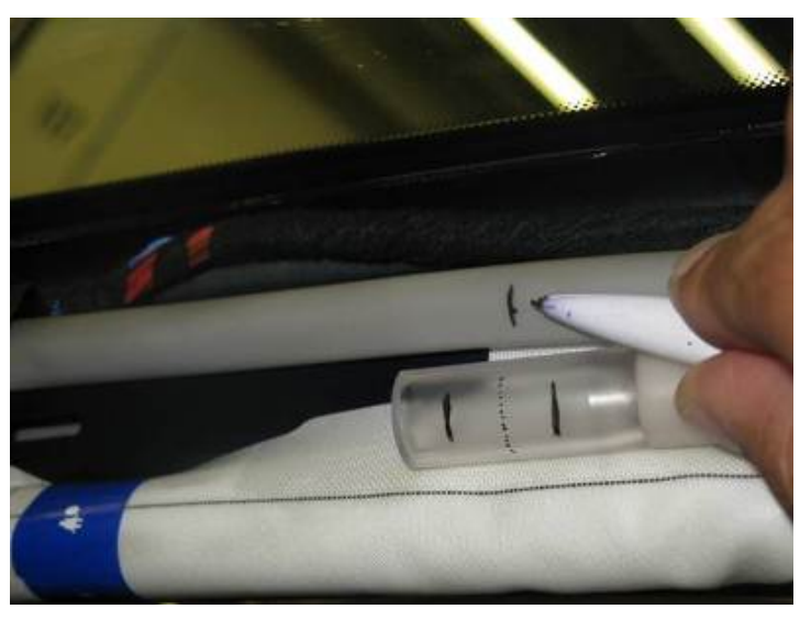
Figure 8. Marked at half the length of the union.

Mark the original hose at half the length of the union on the repair section as shown (Figure 8).