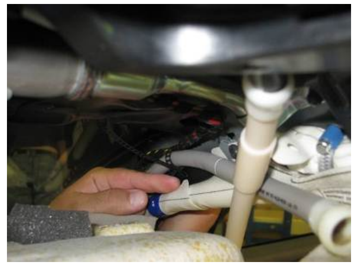
Figure 2. Open existing ties along A-pillar.

2. Open the existing cable ties along the A-pillar (Figures 2, 3, and 4).