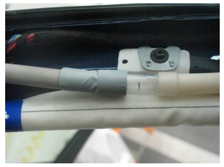
Figure 15. Wrap tape around connection.

11. Wrap the tape around the connection as shown (Figure 15).