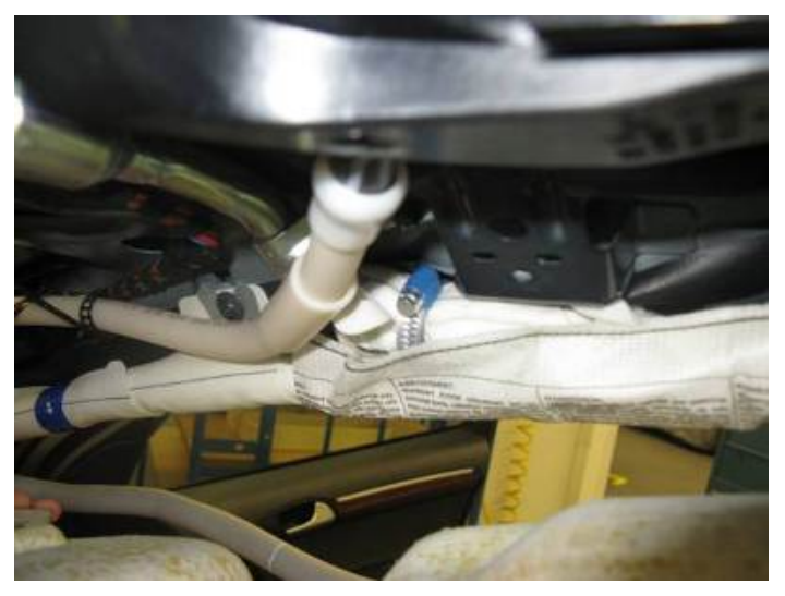
Figure 6. Routing repair section and attaching.

Align both hoses next to one another (Figure 4. 7).