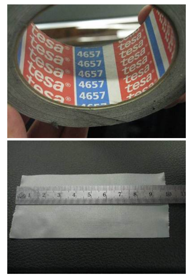
Figure 14. Duct tape and measurement.

Cut a strip of duct tape (or equivalent) approximately 10 cm long and 5 cm wide (Figure 14).