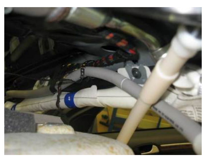
Figure 3. Open existing ties along A-pillar.