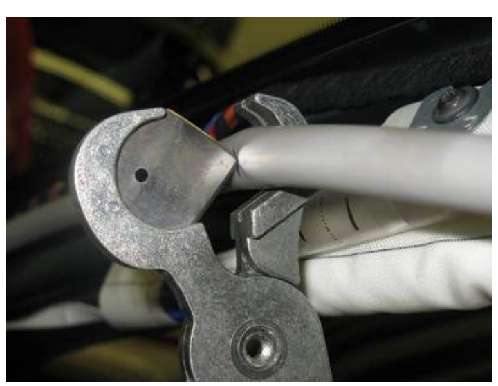
Figure 9. Cut the hose.

6. Cut the original hose at the mark you made in step 5 (Figures 9 and 10).