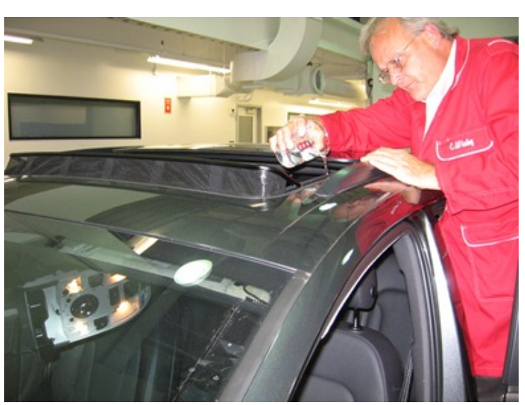
Figure 16. Test by pouring 200ml of water into the drain channels.