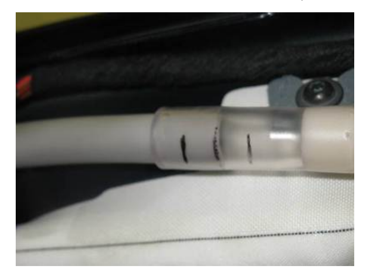
Figure 13. Lower section of hose inserted into the union.

9. Push the end of the lower section into the union to the half-way mark (Figure 13).