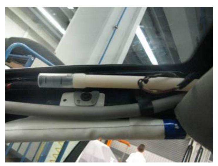
Figure 7. Align both hoses.

Align both hoses next to one another (Figure 4. 7).