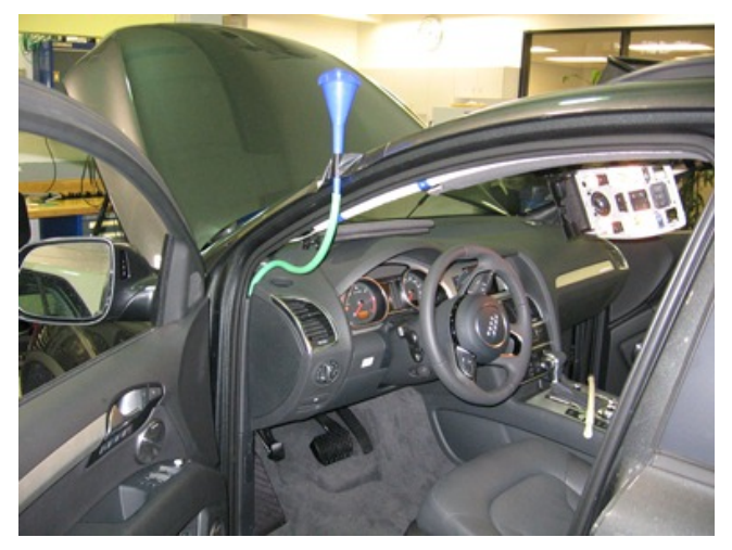
Figure 12. Inspect for any additional leaks or obstructions.