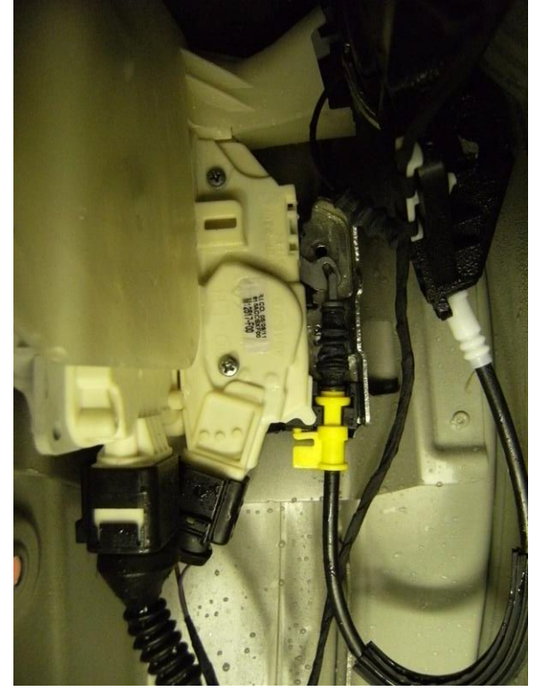
Figure 1. Bowden cable routing.

When fitting the Bowden cable from the mounting bar to the door lock, the cable can get kinked. In some cases, this can increase the inner friction of the strand in the Bowden cable. As a result, the door lock stays in pressed position or does not completely return to its zero position (Figure 1).