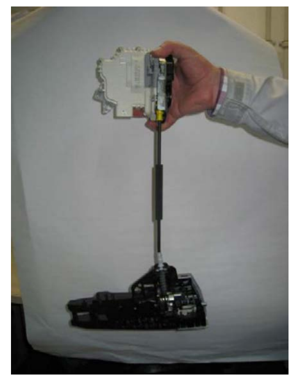
Figure 6. Do not turn the lock or the mounting har

c. Do not twist the Bowden cable after the installation. To avoid twisting the cable, turn neither the lock nor the mounting bar (Figure 6).