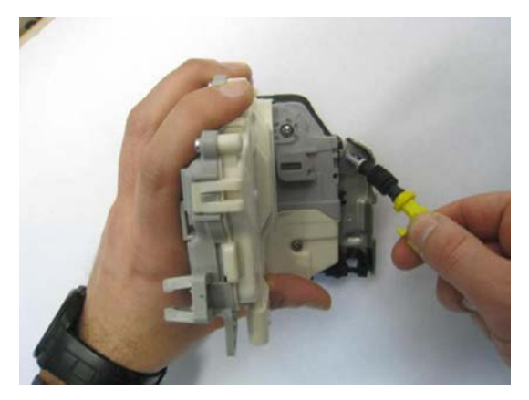
Figure 4. Holding the yellow sleeve in the lock.

a. Position the Bowden cable by holding the yellow sleeve in the lock (Figure 4).