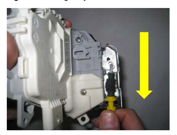
Figure 5. Pulling down the Bowden cable.

Pull down the Bowden cable by holding the yellow sleeve (Figure 5). The locking mechanism is pulled along and the Bowden cable is locked. Slot in the yellow locking mechanism to the left.