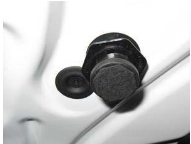
Figure 1. Felt tape applied to contact surface of hood height adjustment stop buffer.