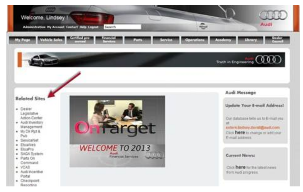
Figure 1. Related Sites section on Accessaudi.com landing page