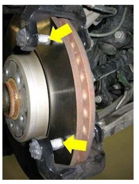
Figure 5. Caliper carrier guide pins with antiseize ( G 052560A2 ) lubricant applied where the pads make contact.

4. Apply a thin coat of anti-seize ( G 052560A2 ) lubricant to the guide pins of the new caliper carrier prior to installing the new brake pads (Figure 5). Only apply this lubricant to the section of the guide pins that will be contacted by the brake pads.