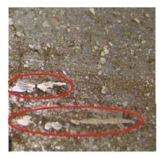
Figure 1. Metallic deposits.