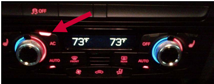
Figure 1: Climate control with A/C LED on

A: You can use other settings for climate control as long as the LED for A/C is illuminated ( Figure 1 ).