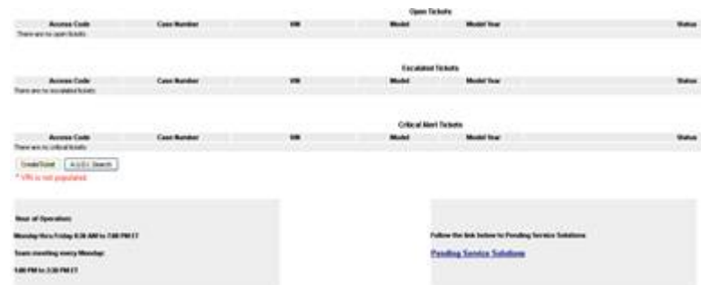
Figure 2. Technical Assistance page