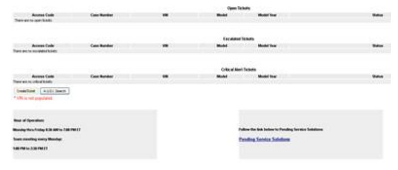
Figure 2. Technical Assistance page