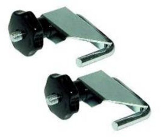
Figure 2. Tool -3094-, hose clamps.