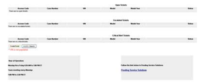
Figure 2. Technical Assistance page

For payment processing, Guided Fault Finding Logs must be documented identifying that the applicable fault codes were present and have been cleared. All claims are subject for review.