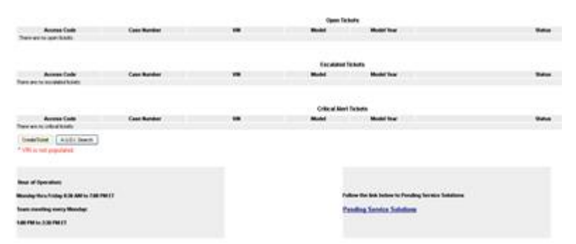
Figure 3. Technical Assistance page