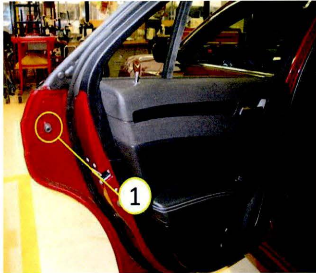
Fig. 2 Left Rear Door