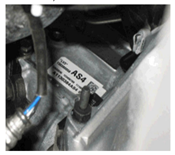
5.3L V8 Engine Assembly (VIN C - RPO L83)