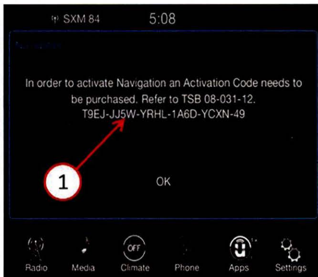
Fig. 1 Request code

NOTE: The person that calls in will need the program ID 40CD1, dealer code, VIN, their SID number and 22 digit request code. They will ask for your e-mail address, so they can send you a confirmation of the activation code. The call center is opened Monday - Friday, 9:00 am to 8:00 pm Eastern Standard time. To expedite, once the 22 digit code is retrieved from the vehicle, multiple vehicles can be activated during one phone call.