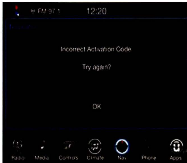
Fig. 3 Incorrect activation code was entered