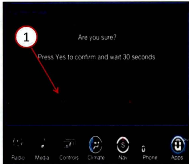
Fig. 4 Factory Reset