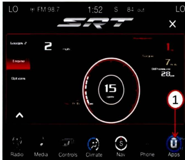
Fig. 1 App Icon with Cell Bar Indicator

1 - Need more than one bar for proper reset.