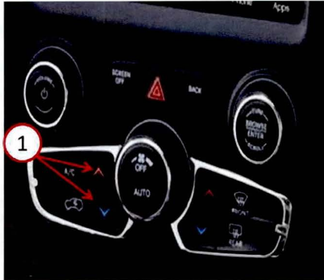
Fig. 2 Entering Reset Mode

1 - Press Up/Down Temp Controls Simultaneously for 5 Seconds