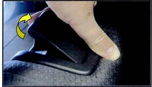
Verify excessive effort required to operate handle.

You may need to apply pressure to the seatback in order to free a jammed recliner mechanism.