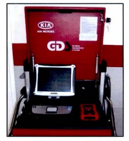
Global Diagnostic System (GDS)

This bulletin provides information related to HVAC controller software upgrade for 2014MY Sorento vehicles, produced from January 24, 2013 to September 22, 2013, equipped with Auto (FATC) or Manual HVAC controls. The concern relates to the possibility of diminished A/C performance in high humidity climates, where slight icing may occur on the evaporator core and restrict airflow through the dashboard vents. To correct this condition, upgrade the HVAC controller logic using the procedure outlined in this TSB. For confirmation that the latest reflash has been done to a vehicle you are working on, verify ROM ID using the tables in this TSB.