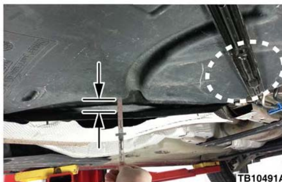
Figure 1 - Article 13-12-4

NOTE: The information contained in Technical Service Bulletins is intended for use by trained, professional technicians with the knowledge, tools, and equipment to do the job properly and safely. It informs these technicians of conditions that may occur on some vehicles, or provides information that could assist in proper vehicle service. The procedures should not be performed by "do-it-yourselfers". Do not assume that a condition described affects your car or truck. Contact a Ford, Lincoln, or Mercury dealership to determine whether the bulletin applies to your vehicle. Warranty Policy and Extended Service Plan documentation determine Warranty and/or Extended Service Plan coverage unless stated otherwise in the TSB article. The information in this Technical Service Bulletin (TSB) was current at the time of printing. Ford Motor Company reserves the right to supersede this information with updates. The most recent information is available through Ford Motor Company's on-line technical resources.