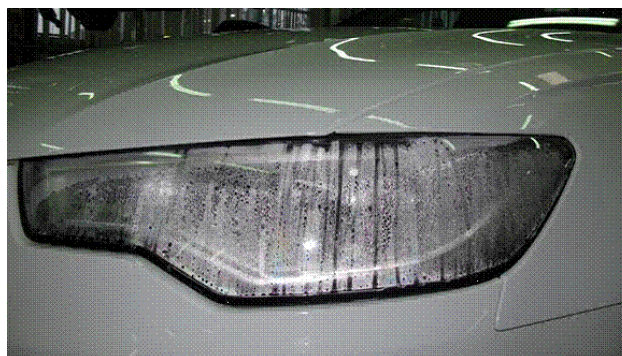
Figure 1. Headlight with heavy condensation

Tip: Reference TSB 2012749, 94 Exterior lights, moisture accumulation . Headlights that are applicable to TSB 2012749 do not apply to this bulletin unless cracking is present.