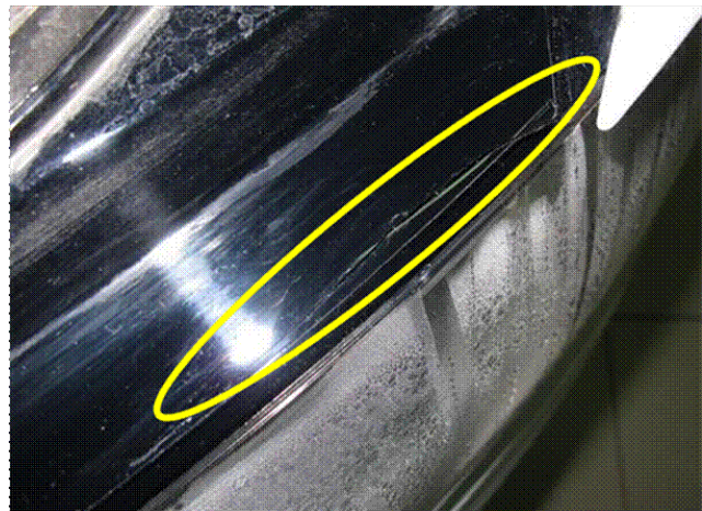
Figure 5. Upper headlight housing cracking.