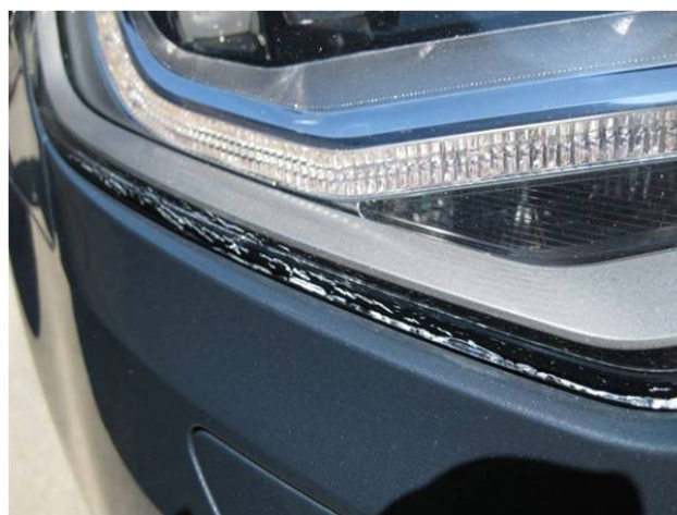
Figure 2. Lower headlight lens cracking.