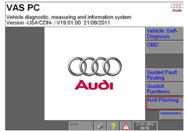
Figure 2. Audi Flashing.

Tip: If you do not have the latest Base/Brand CD installed on the tester, then the SVM code may fail and return an "ASM-MCD base system error" because the tester is not capable of reading the software flash file. Starting with the model year 2010, some software files have changed and cannot be read with base tester software level 15 or lower. Level 16 or higher must be installed on the tester along with all released patches found on ServiceNet. VAS Tester Patches can be found using — www.AccessAudi.com >> Special Tools and Equipment >> VAS Tester Information >> Software.