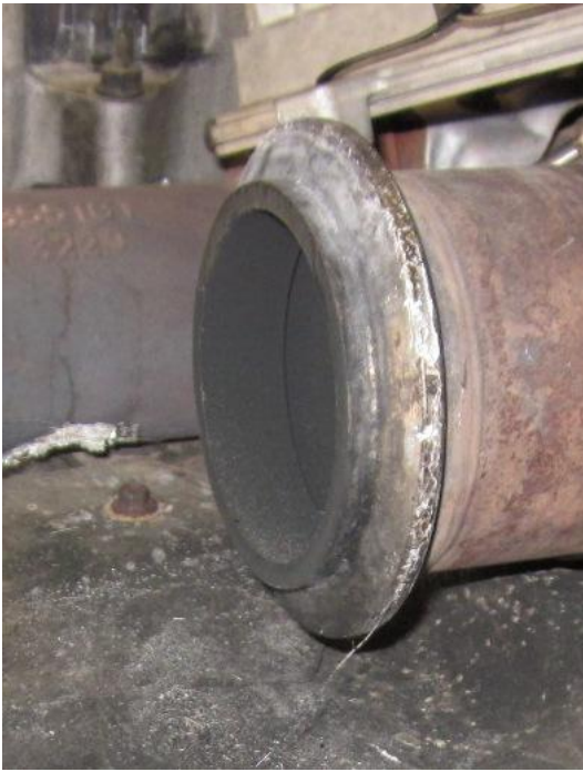
Joint & Clamp Location at Rear of Engine