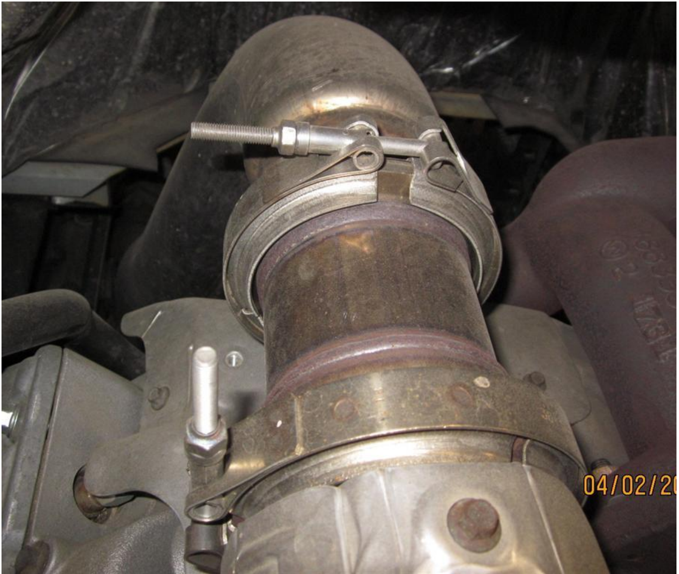
Install Gasket between two Flanges