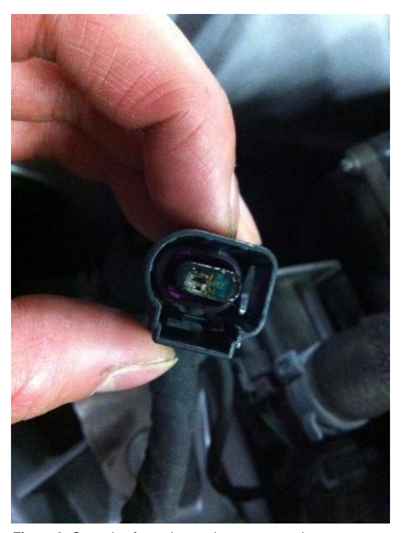
Figure 2. Corrosion formation on the connector pins.

The connectors, wiring harness, and / or connected control units may have been damaged from exposure to coolant (Figure 2).