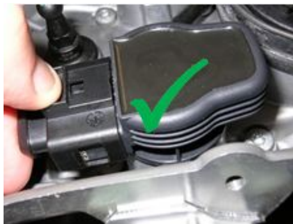
Figure 1. Correct method of disconnecting the ignition coil.