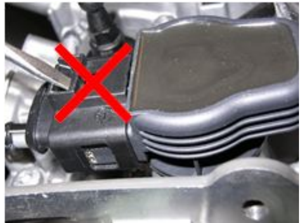
Figure 3. Incorrect method of disconnecting the ignition coil.

3. Check the part number of the coils (Figure 3). If one of the following part numbers is installed, all four ignition coils will need to be replaced: