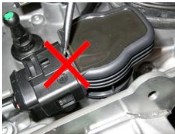
Figure 2. Incorrect method of disconnecting the ignition coil.