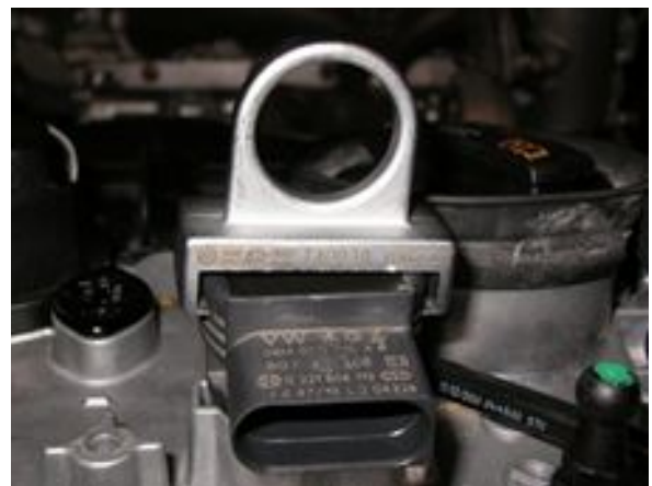
Figure 4. Special tool T40039 .

Note: Always use special tool T40039 to remove ignition coils (Figure 4).